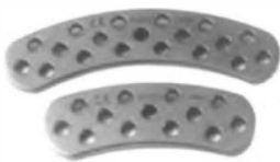
Arch with Holes

Cat. No. Description 201012 Small Size 201014 Large Size