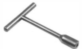
Triangular T-Wrench For Pins